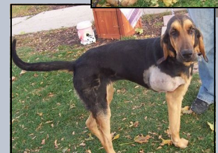
And this is Naomi, swollen injured leg before surgery and resting comfortably after.