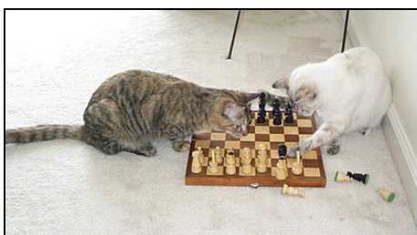
Smart indoor cats enjoying a game of chess

So, think about it: Is it cruel to keep your cat inside safe, warm and loved, with toys for stimulation and lots of room to run around, maybe a window perch or hammock to sit on and watch the birds outside? Or is it cruel to expose it to the dangers outside just because it doesn't know any better and is only responding to primitive instincts and curiosity?